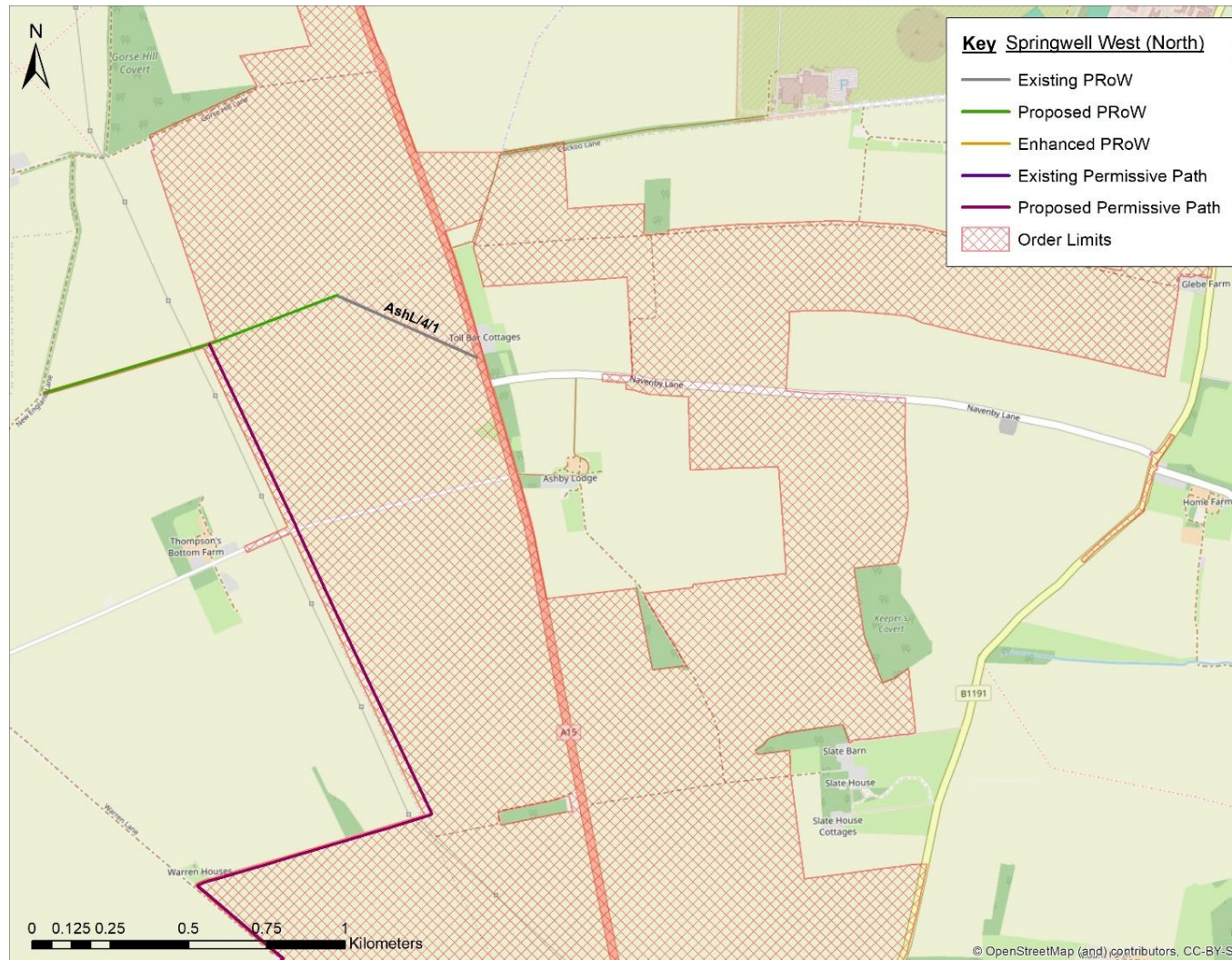
Plate 3.4: Springwell West North